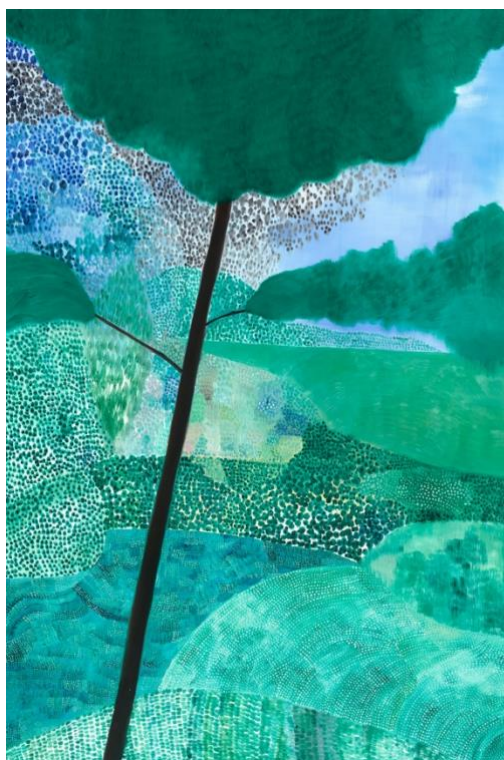
SALLY ROSS born 1969 Landscape 2020 oil on board, 150 x 100 cm SOLD © Sally Ross. All Rights Reserved 2020

Melbourne | +61 (0)3 9508 9900 | Thomas Austin | Thomas.Austin@smithandsinger.com.au